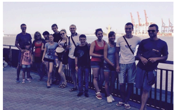
Young Adults from SOS House

hostel with no support. They are given a monthly allowance and they are expected to know how to manage their finances and survive on their own. They haven't been taught life skills such as cooking, cleaning and budgeting but they are expected to live independently once they leave the orphanage. Through our ministry partner, SOS Mission, and our supporters we have been able to help these young people prepare for life after the orphanage. SOS Mission mentors young adults before they leave high school and continues to mentor them once they start their studies at college or trade school. Please pray for these young people as they start this new chapter in their lives. Some of the young people live at SOS Mission House and they feel like part of a family for the first time in their lives.