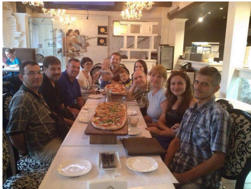
Refugees from eastern Ukraine