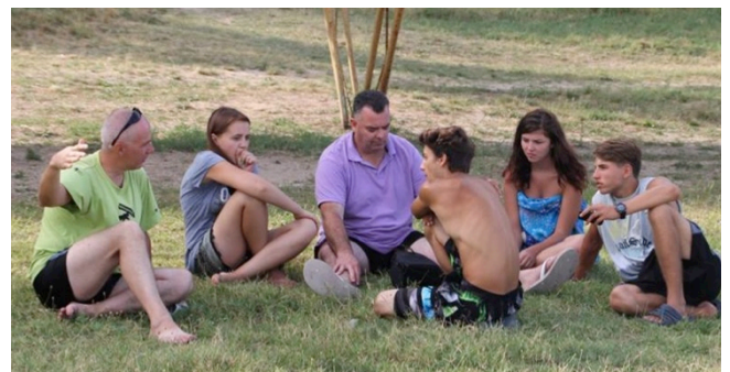
with orphans at summer camp

The war in eastern Ukraine continues, and there is so much need in the country right now. Young people displaced by the war struggle to make their allowance last the whole month. Through the generosity of our supporters we were able to help a group of teenagers who had finished high school and were about to start their studies at the trade school. We helped them buy food, school supplies and winter clothes in time for the start of their course in September. They had been given a small amount of food and were told to wait for their allowance at the end of the month. We are privileged to have been able to help them at such a difficult time.